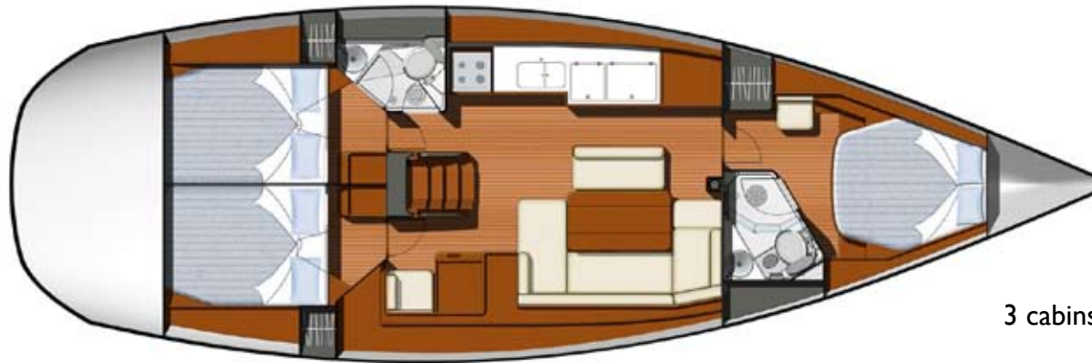
3 cabins version / 2 heads