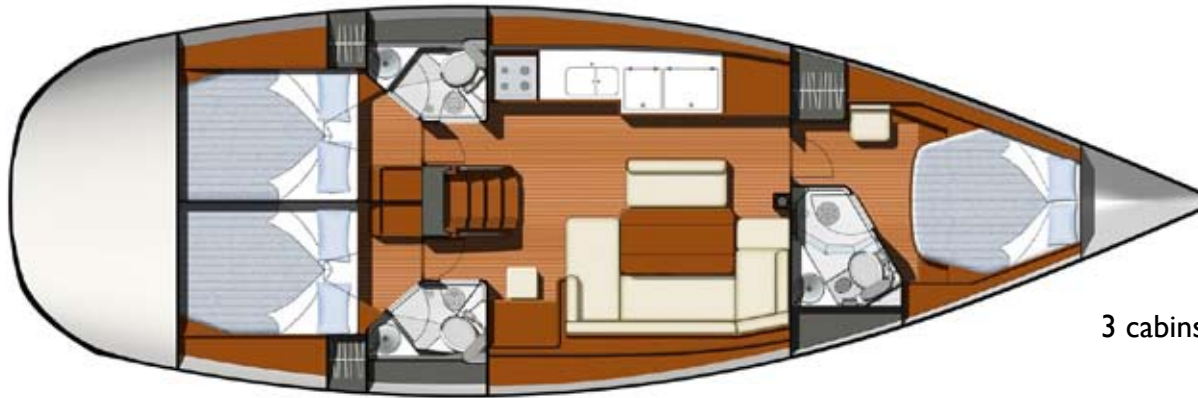
3 cabins version / 3 heads